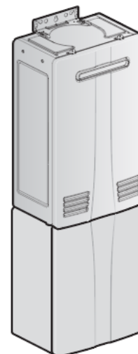
NAVIEN WATER HEATER OUTDOOR MODEL